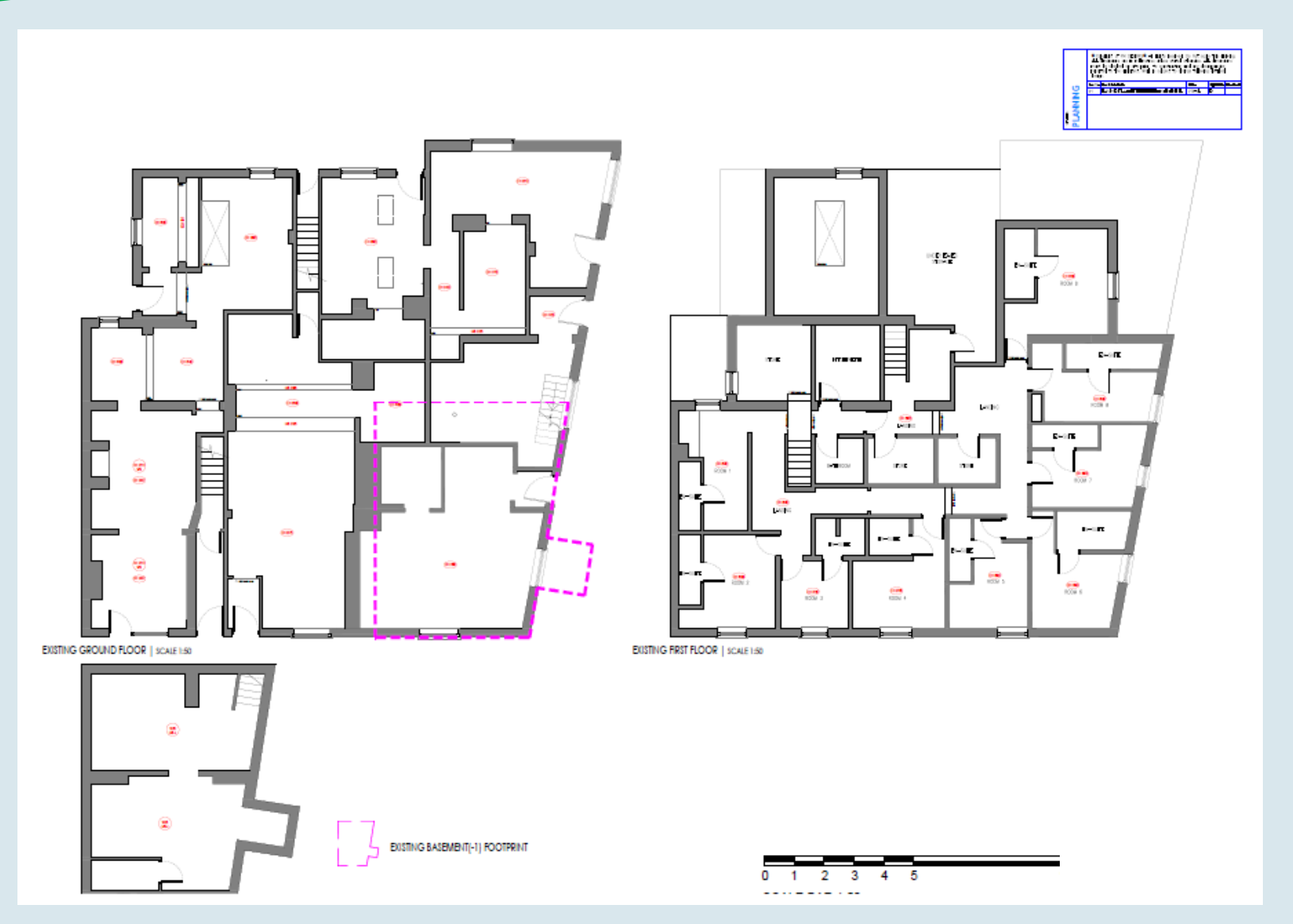
Application Number: 23/00349/COU