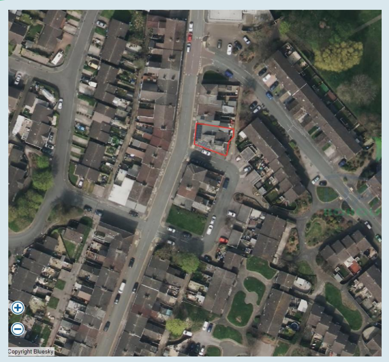
Application Number: 23/00349/COU