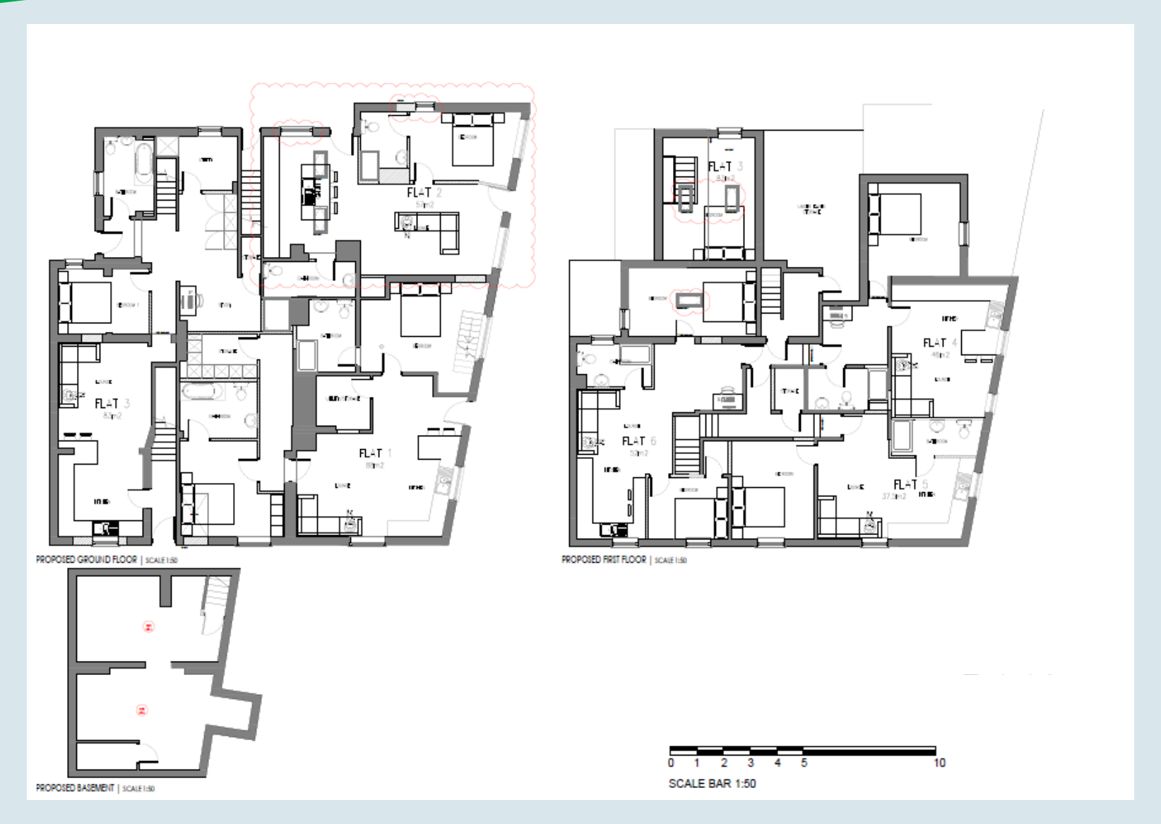
Application Number: 23/00349/COU