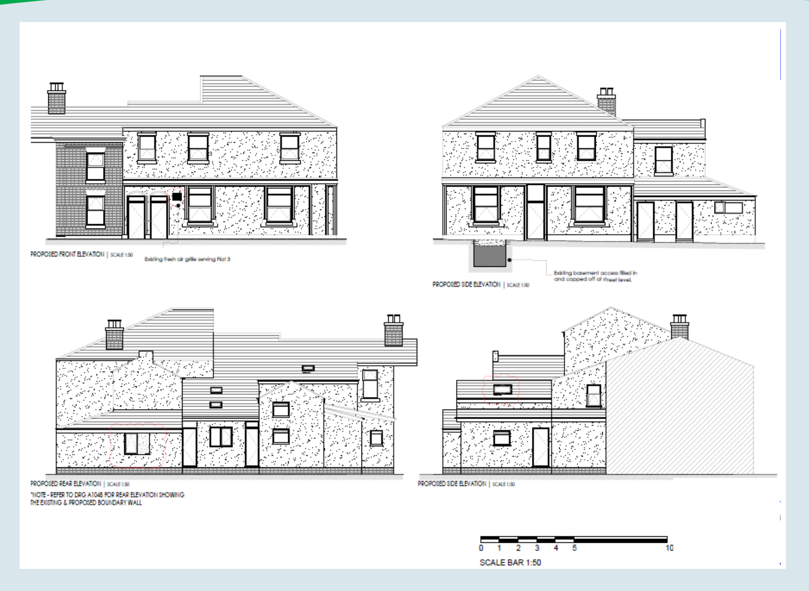
Application Number: 23/00349/COU