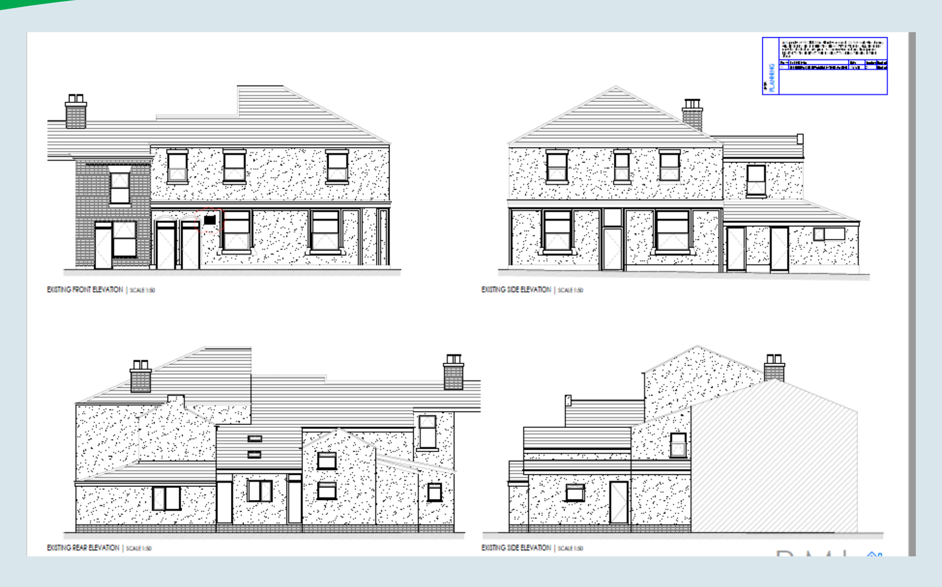
Application Number: 23/00349/COU