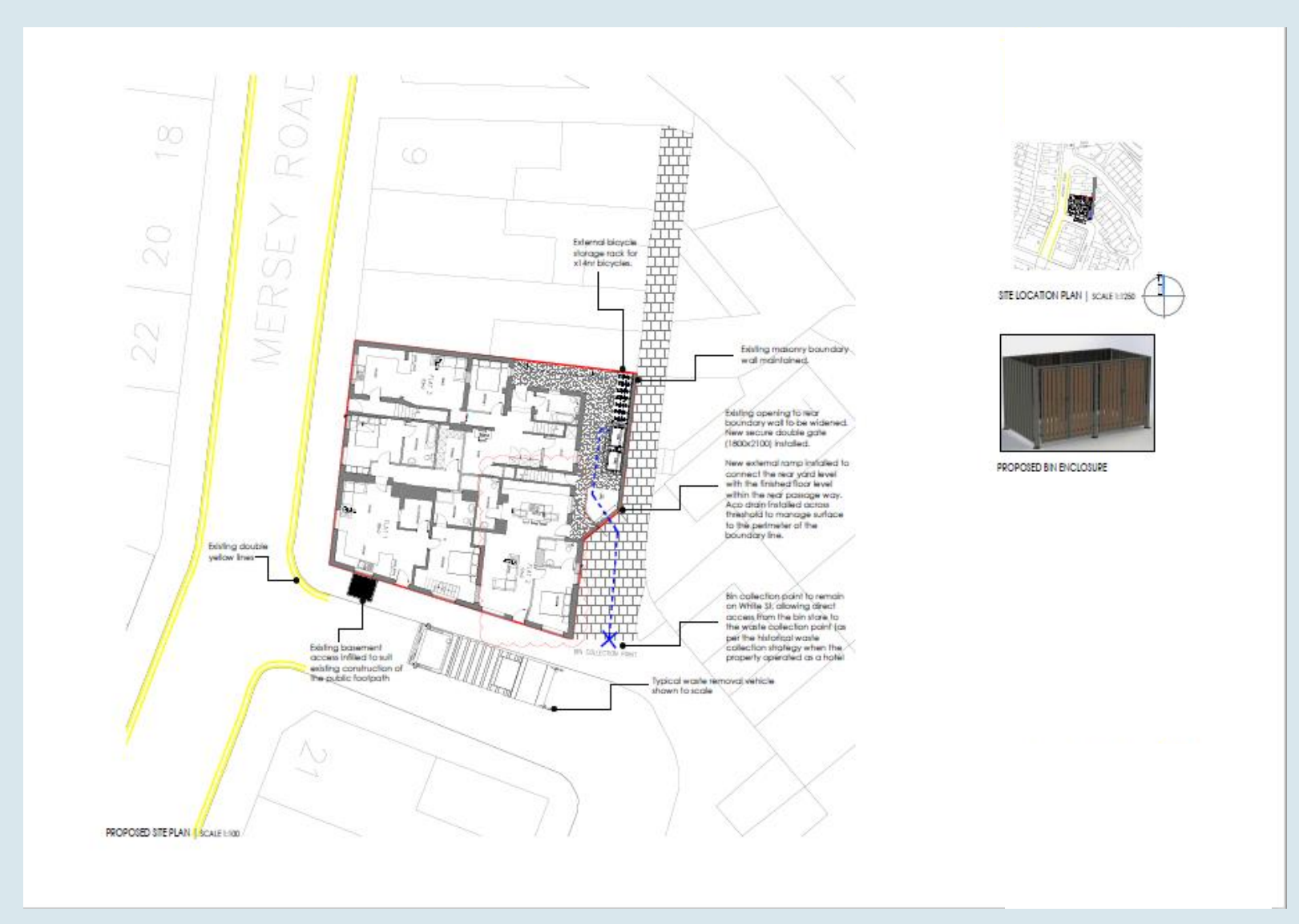
Plan IJ: Proposed Site Plan